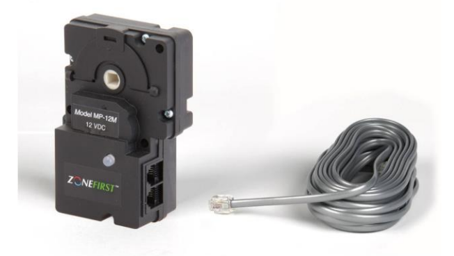
Actuator & 25' of modular cord included with each damper

The RTP motor also has a two-color Light Emitting Diode (LED) to indicate the damper position. When the LED is GREEN the damper is Open. When the LED is RED the damper is Closed. When the LED is not lit the motor is typically moving between open and closed. The motor cycles between open and closed in less than 5 seconds